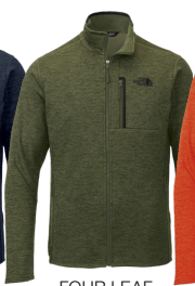
FOUR LEAF CLOVER HEATHER