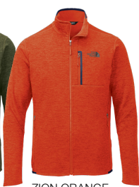
ZION ORANGE HEATHER