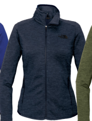
URBAN NAVY HEATHER