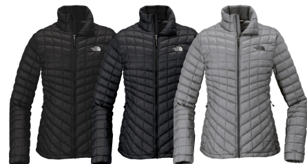
TNF MATTE BLACK