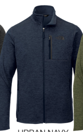
URBAN NAVY HEATHER