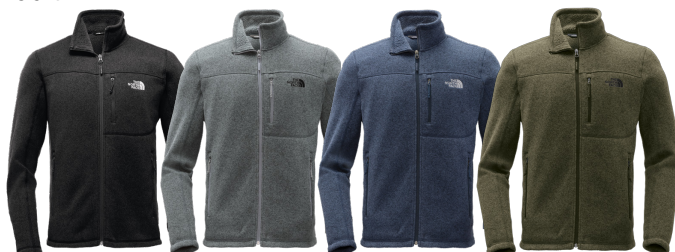
TNF BLACK HEATHER