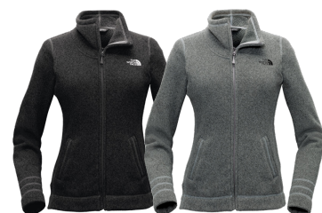
TNF BLACK HEATHER