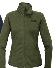
FOUR LEAF CLOVER HEATHER