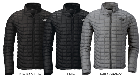
TNF MATTE BLACK