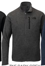
TNF DARK GREY HEATHER