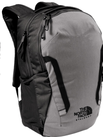
MID GREY DARK HEATHER/TNF BLACK