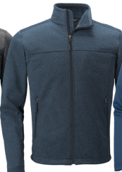
URBAN NAVY HEATHER