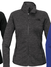
TNF DARK GREY HEATHER