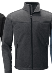
TNF DARK GREY HEATHER